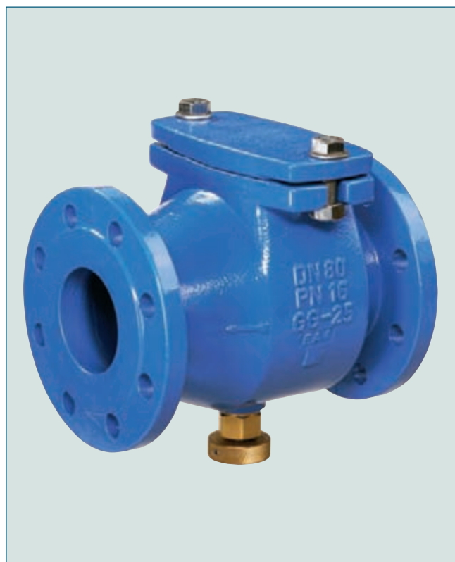
Type RV 10 with a crack device.