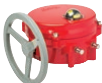
Output Torque 300 to 18,000 lb-in