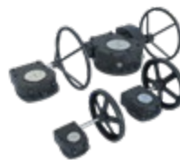
Output Torque 5,310 to 70,000 lb-in