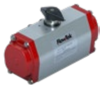
Output Torque 50 to 44,130 lb-in at 80 psi